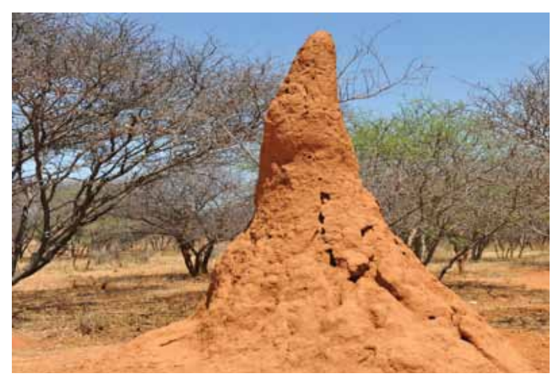
The natural HVAC systems found in large termite mounds in Sub-Saharan Africa were used as models for the systems in the Eastgate building in Harare, Zimbabwe.

A similar noise problem existed with the overhead electrical connection of the bullet train, specifically the sound made by the panto-